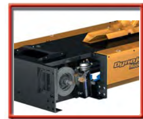
AIR BRAKE OPTION